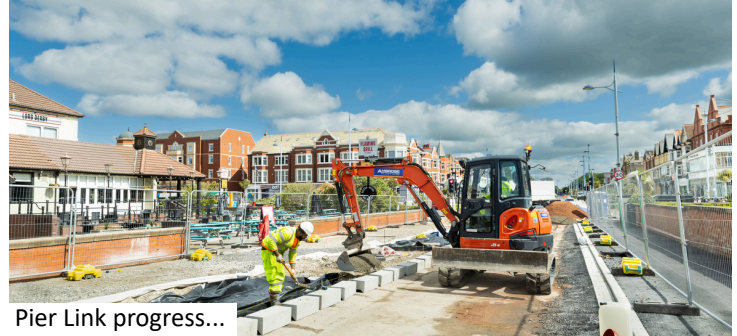
Pier Link progress...