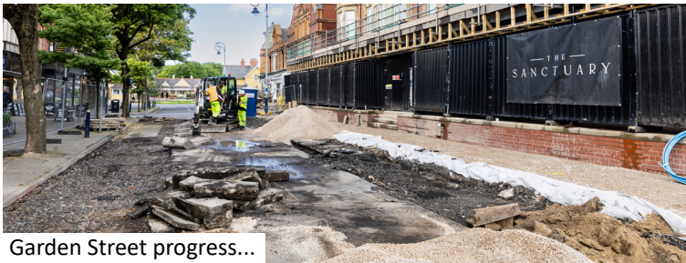
Garden Street progress...