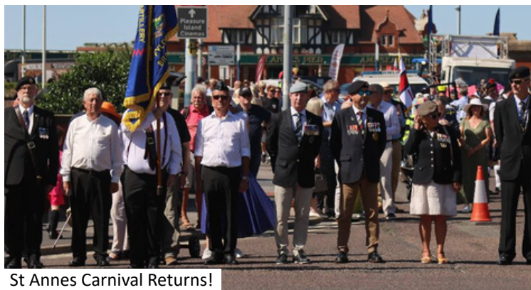
St Annes Carnival Returns!