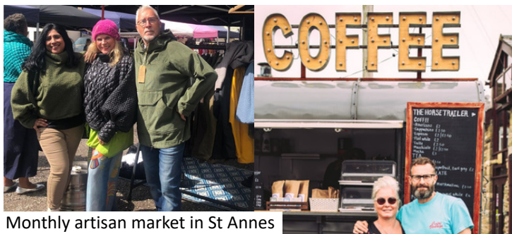
Monthly artisan market in St Annes