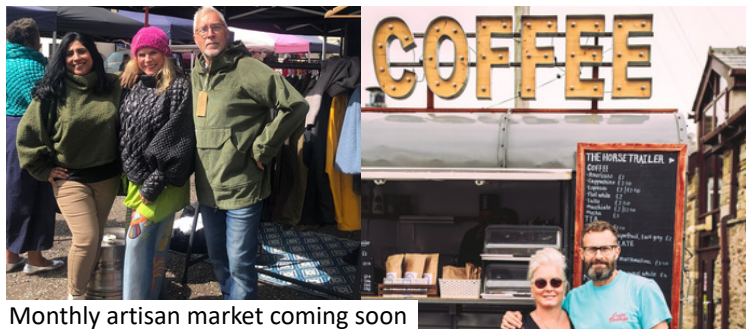
Monthly artisan market coming soon