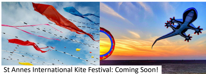
St Annes International Kite Festival: Coming Soon!