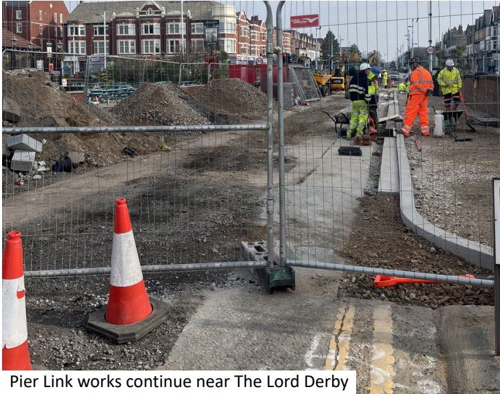
Pier Link works continue near The Lord Derby