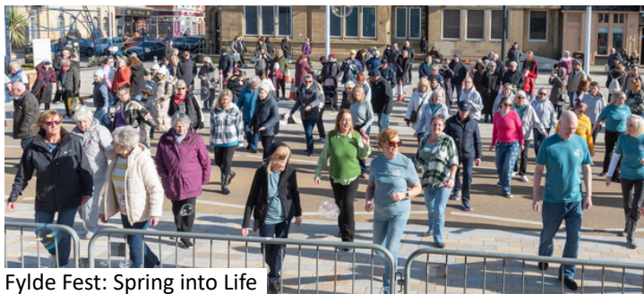
Fylde Fest: Spring into Life