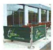
Banner style perimeter