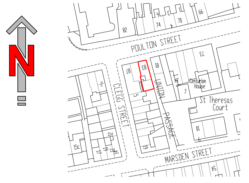
LOCATION PLAN 1 : 1 2 5 0